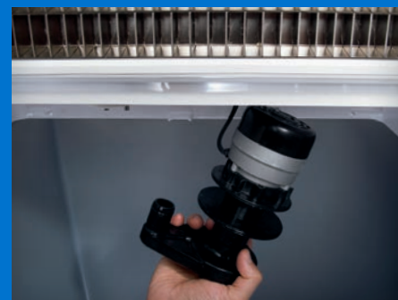
Snap-fit water pump