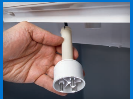
Snap-fit water probe