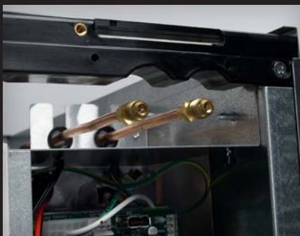
Easy Frontal Service Access Ports