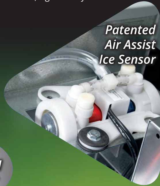
Patented Air Assist Ice Sensor