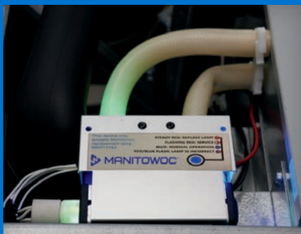
LuminIce II Growth Inhibitor accessory