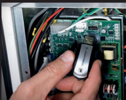
USB Port Firmware Updates