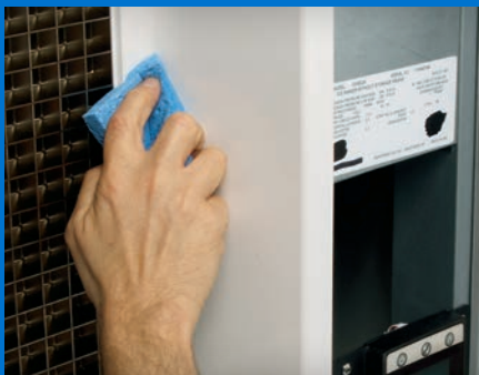
Rounded foodzone corners