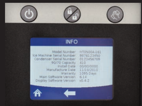
One touch machine info