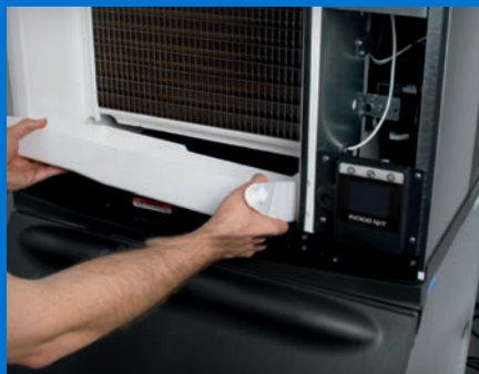
Removable water trough