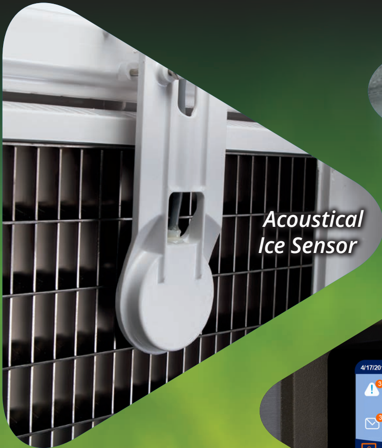
Acoustical Ice Sensor

Indigo NXT is the most efficient cube ice machines on the market today. Many of the new models incorporate R410A refrigerant, which is environmentally friendly and has 48% less global warming potential than previous models. All models are AHRI certified, as well as, exceed the stringent 2018 DOE (Department of Energy) minimums for energy usage. Many models are ENERGY STAR® 3.0 qualified, which makes them available for rebates from local energy companies. Indigo NXT is up to 43% more energy efficient than previous models, significantly lowering the cost of ownership.